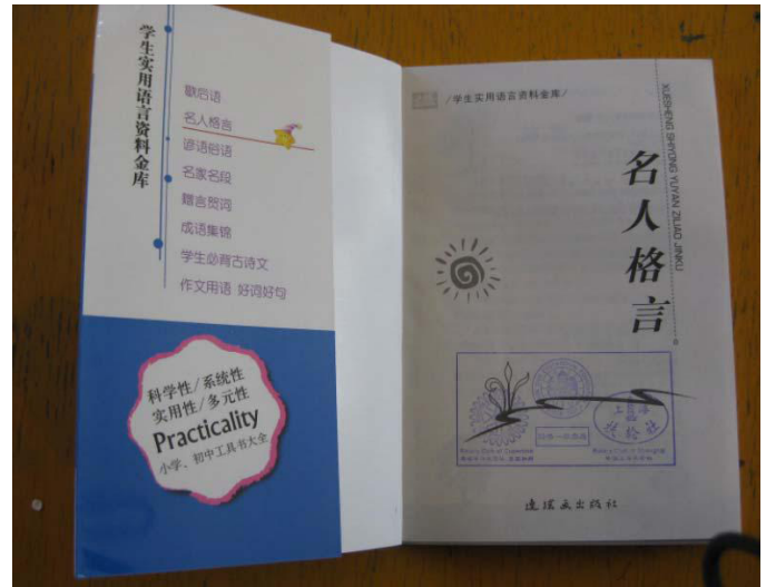
Every book shipped bears the stamps of Shin Shin, Cupertino Rotary, and Shanghai