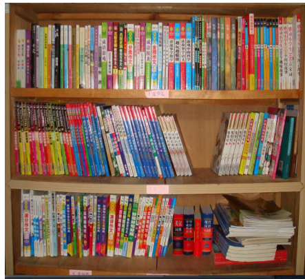
Every library has 1000 books

cases where logistics make a full library impossible, the alternative will be a scaled down version, making the most of available space and resources with book trolleys and other dedicated book areas.