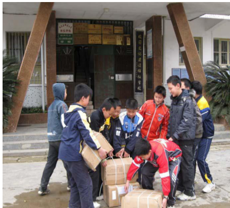
Books received in a Shin Shin school