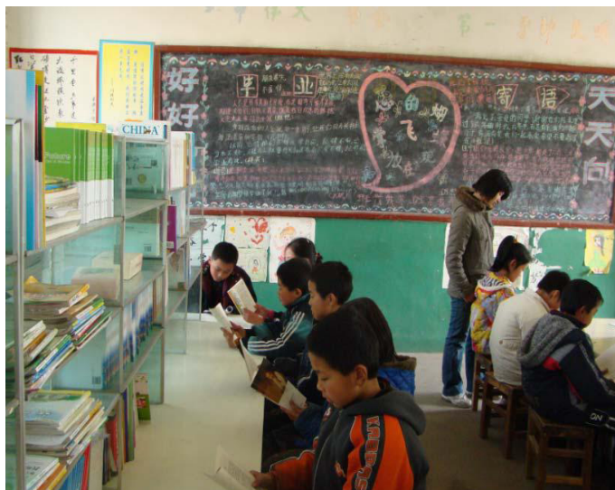
Students reading books in library